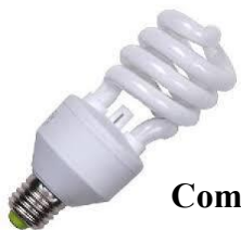
Compact Fluorescent Lamps (CFL's)

Broken Lamps can release mercury and other contaminates into the air and water